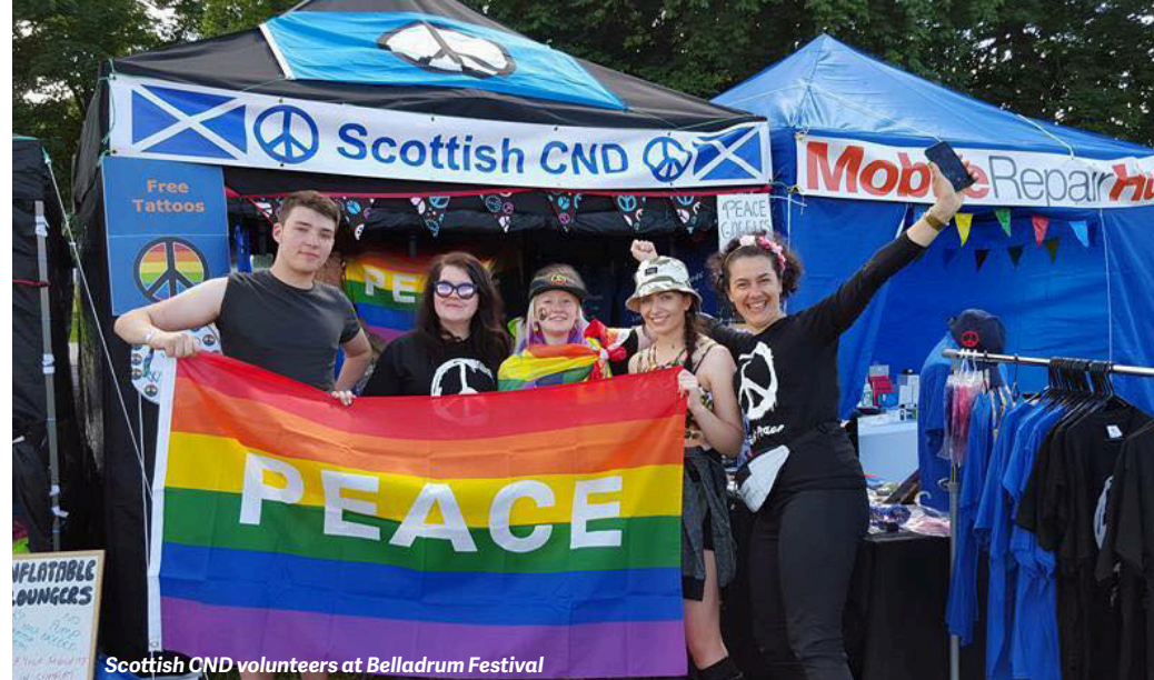
Scottish CND volunteers at Belladrum Festival

Overlapping the Peace Academy, from 27 to 30 July, is Glasgow's Mugstock Festival in Mugdock Country Park. The Festival organisers have invited Peace Academy participants to perform a human peace symbol alongside the headline performance of Colonel Mustard & The Dijon 5 on Friday 27 – festival entry that evening is FREE to participants! There will also be an InspYre social evening on Saturday 28 followed by a visit to the Faslane Naval