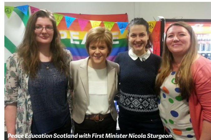
Peace Education Scotland with First Minister Nicola Sturgeon