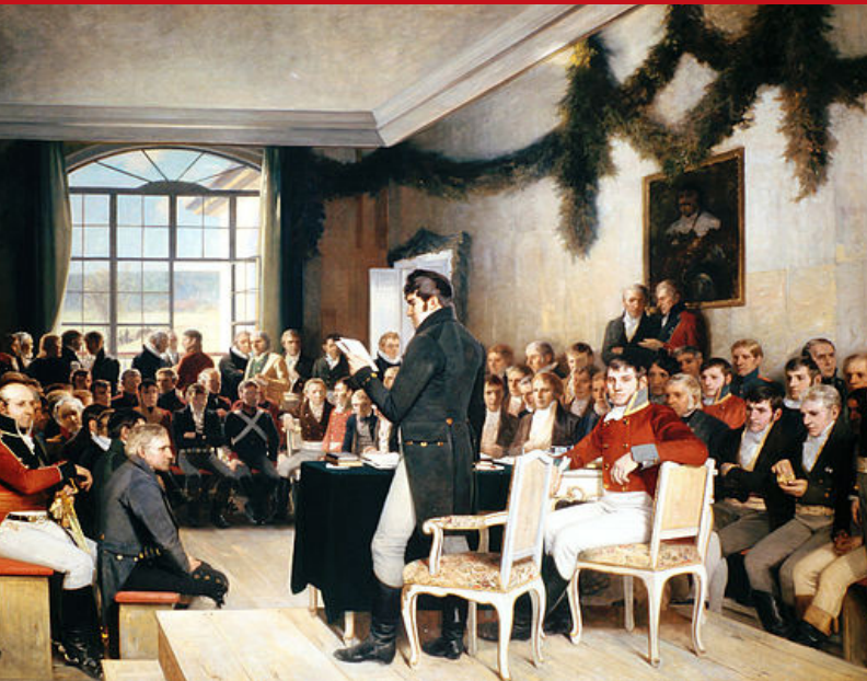
Eidsvoll - constitution 1814.

Still a touchy subject between the two countries relates to Hitler's invasion and occupation of Norway in 1940. Iron ore was vital for Germany's war machinery but their own iron was of poor quality compared to that produced in the north of Sweden. The iron ore from places like Gällivare, Malmberget and Kiruna was exported via rail to the ports of Narvik in Norway and Luleå in Sweden. But the sea outside of Luleå froze in winter, which was not the case in Narvik. Hence Narvik was the better choice for Hitler, so the Germans occupied Norway which, like its Scandinavian neighbours, had remained neutral. Did Sweden support Norway against the Nazis? The short answer is 'no' and it probably would not have helped their neighbour anyway. If Sweden had sent military forces to fight the Nazis in Norway many historians think there was a high probability that Hitler would have occupied Sweden too.