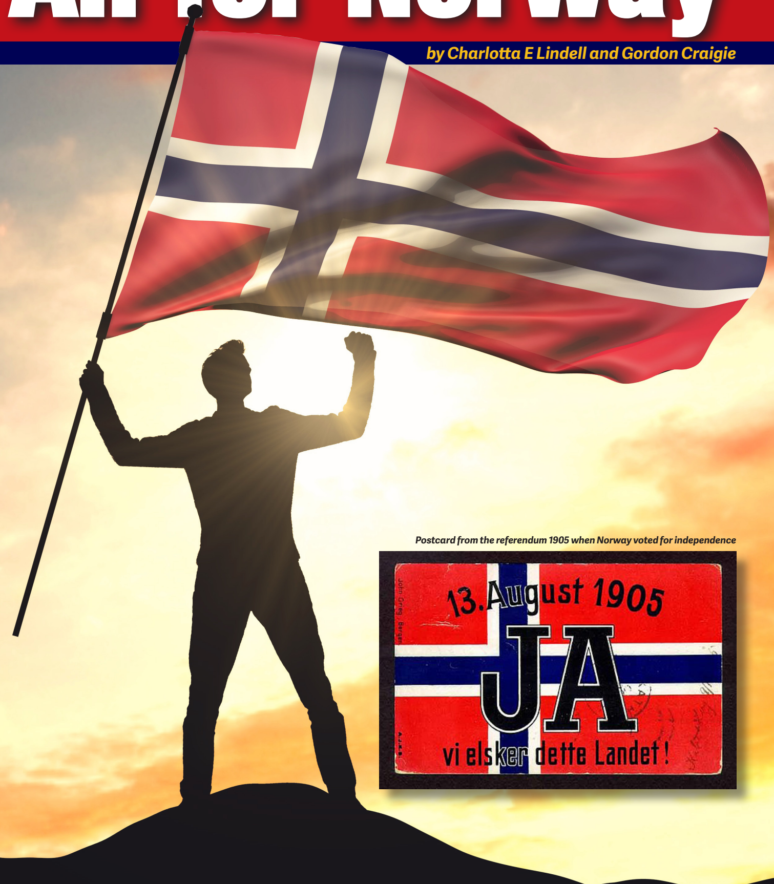
Postcard from the referendum 1905 when Norway voted for independence

Yet, even if the resistance towards the Union was strong in Norway this dissatisfaction would not be resolved finally until 1905. The Swedish King of Norway and Sweden, Oscar II, knew it was inevitable that Norway would one day become independent from Sweden but hoped it would not happen in his lifetime. When the Norwegian Government finally decided that they should have their own consulates in spite of what Sweden said, Oscar II refused to accept the decision. The Norwegian Government subsequently handed in its resignation, but this was not accepted by the King. In the ensuing stand-off, both sides mobilised their military forces and war was perilously close. Thankfully this was avoided after negotiations and independence was confirmed in the Union Dissolution Referendum of August 1905. In a subsequent referendum to decide if Norway should remain a Kingdom or become a Republic, the people voted in favour of a Kingdom.