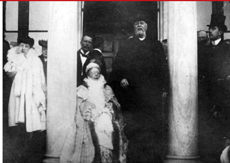
King Oscar II speech on the steps to Rosendal's Castle on Djurgården in Stockholm in connection with the dissolution of the Union 1905. To the left of the King: sitting down Queen Sofia and to the left of her Prince Charles and the crying princess Ingeborg. To the right Crown Prince Gustaf.

Nowadays Norway and Sweden exist happily side by side