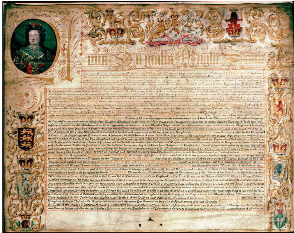
The Articles of Union

Even the UK Parliament website acknowledges these riots: "As negotiations progressed, the public mood became increasingly volatile, and during 1706 there was frequent civil unrest and disorder in Scottish towns" and "In October 1706 the Scottish Parliament met to consider and ratify the Articles of Union. Publication of the Articles triggered widespread unrest. Violent demonstrations took place outside Parliament House and inside there were fears that the building would be invaded by protestors". Troops were apparently deployed with orders to shoot if necessary, but