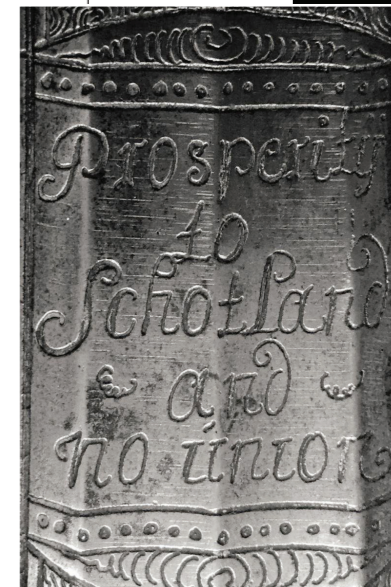
Jacobite broadsword with inscription

Well, according to the British history we were all taught in school, everything was fine!