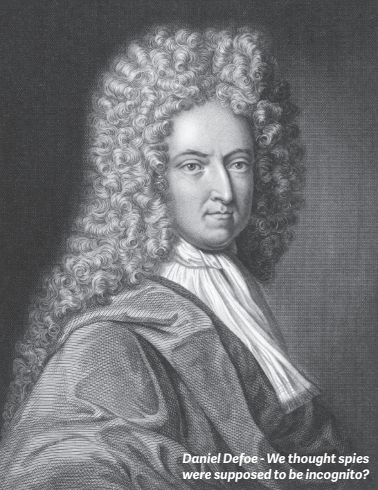
Daniel Defoe - We thought spies were supposed to be incognito?