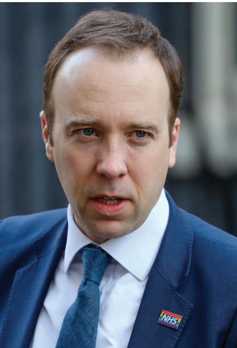
What's the difference between Matt and Tony Hancock? One was deliberately a comedian...