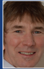
Coming to a hard border near you as soon as possible!