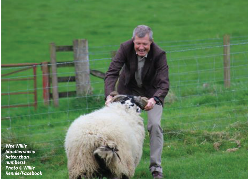
Wee Willie handles sheep better than numbers!